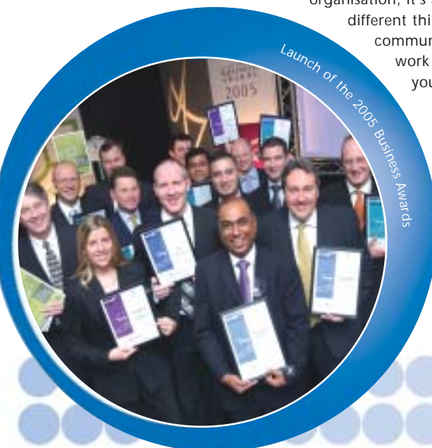
Launch of the 2005 Business Awards