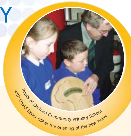
Pupils of Orchard Community Primary School with David Taylor MP at the opening of the new boiler

The Leicestershire Rural Partnership comprises 19 organisations, including the county, district and borough councils along with the LSEP and the Rural Community Council who deliver a wide range of services to rural Leicestershire. For further information visit the Partnership's website at www.oakleaves.org.uk